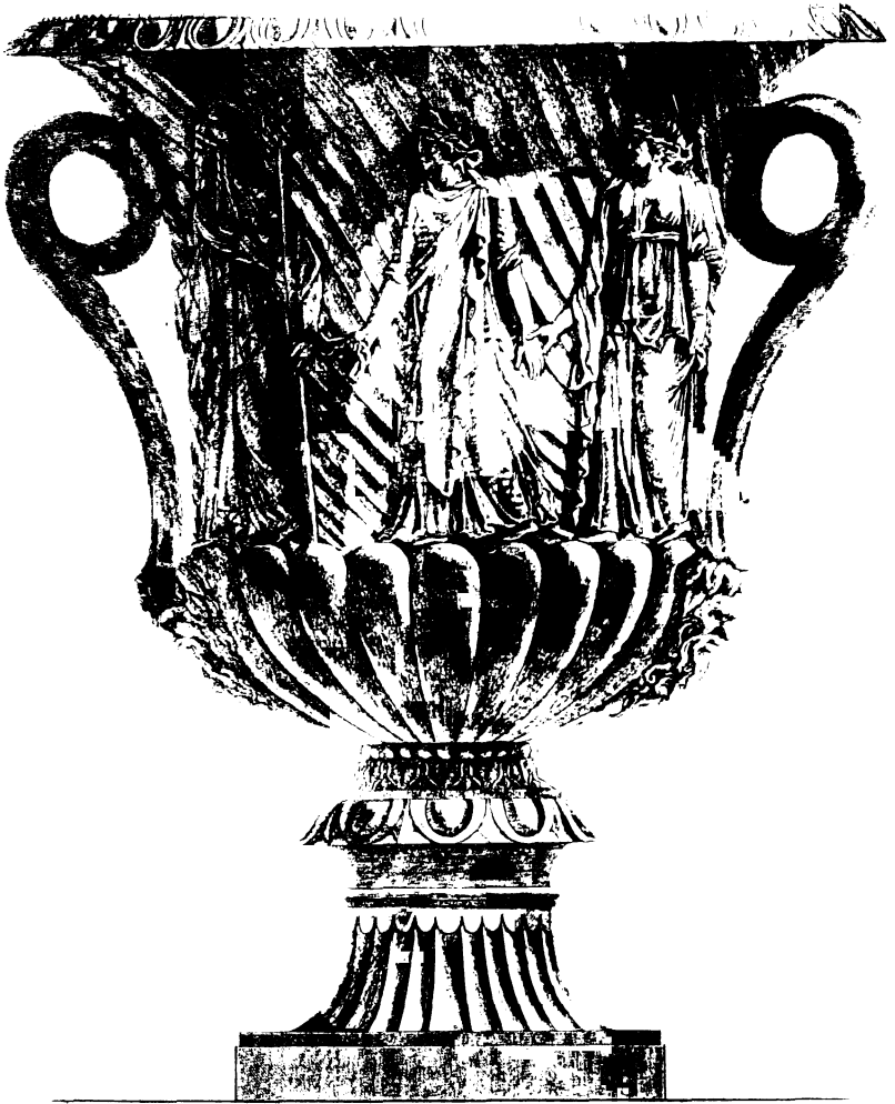
‘Figures on a Greek vase: a man and two women’

FROM AN ETCHING IN PIRANESI’S VASI E CANDELABRI